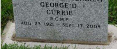
UPRIGHT GRANITE HEADSTONE 76.2 cm high 45.72 cm wide 7.62 cm thick