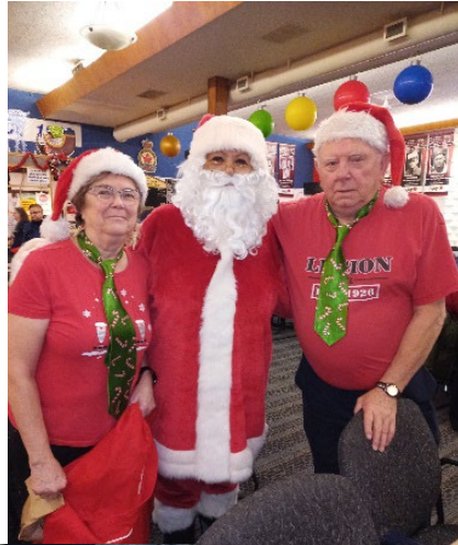
Caroling night and Santa came to visit! Were you naughty or nice this year?! Annual sing off between Executive and Staff happened with Executive winning AGAIN (of course! Haha)