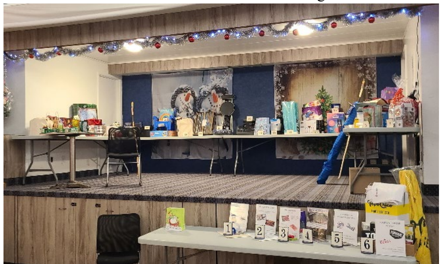
All of the 50+ donations for Big Meat Draw