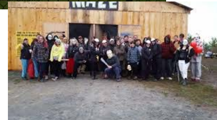
Haunted Trail Maze Support