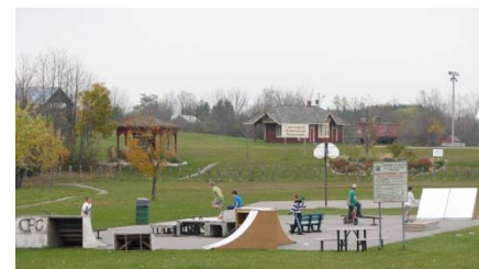
Small skatepark & Basketball court