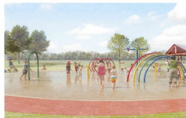
Splash Pad with Shelter in Claire Hardy Park