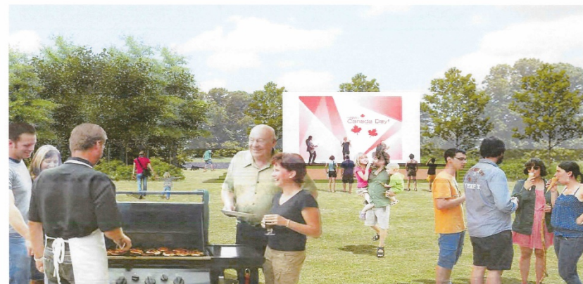
Event Area in MacLeod Park showcasing new performance stage for festivals such as Canada Day