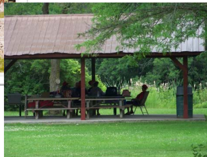
North Picnic Shelter