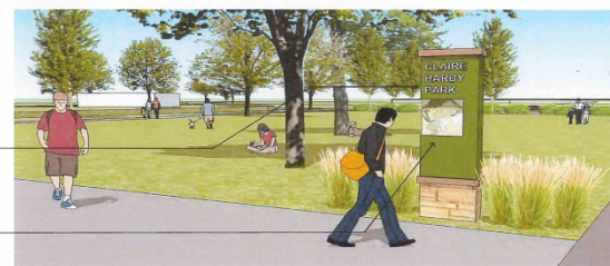
Claire Hardy Park Wayfinding Signage