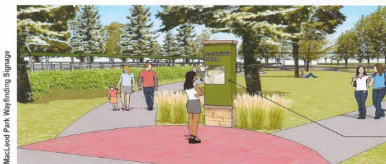
MacLeod Park Wayfinding Signage