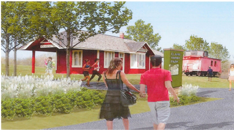
Cannington Historical Society's Train Station showcasing new pathways, signage and vegetation

The Recreational Heart of Cannington - MacLeod & Claire Hardy Parks