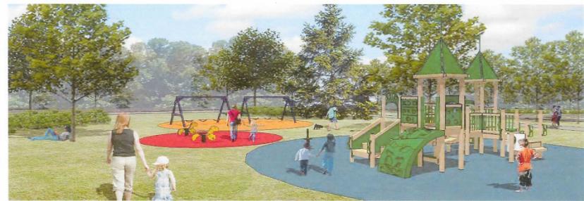
Updated Accessible Playground in MacLeod Park