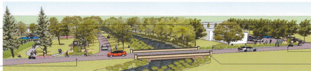
Perspective Showcasing MacLeod and Claire Hardy Parks Entry / Gateways