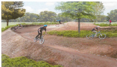
BMX / Mountain Bike Skills Course