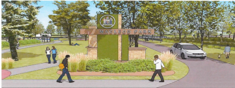
Entry / Gateway into MacLeod Park