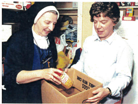
Food Bank and local Soup Kitchen

Our self-contained bed sitting room is located at our convent house in Rossway and is available to individuals throughout the year.