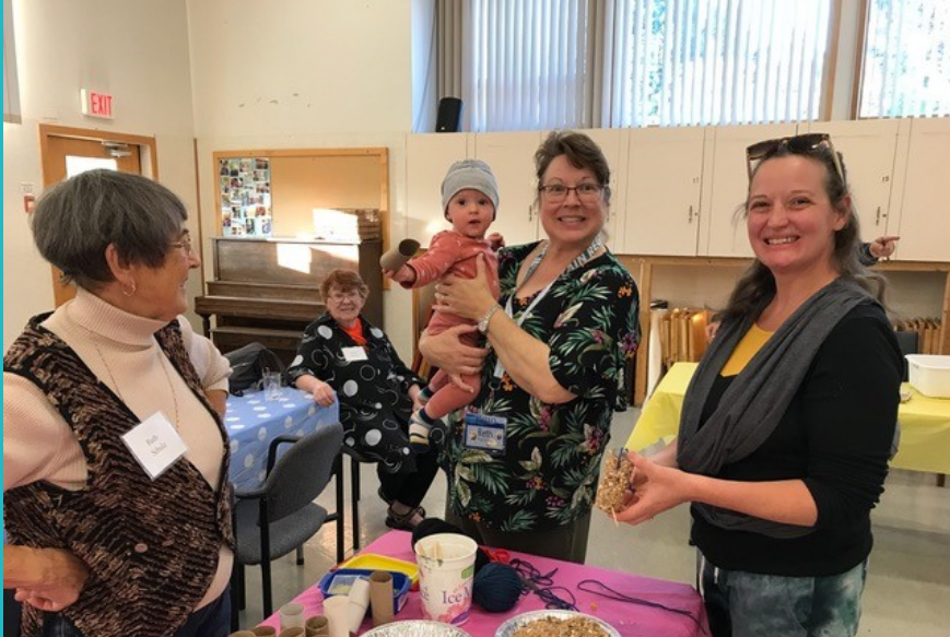
September Messy Church