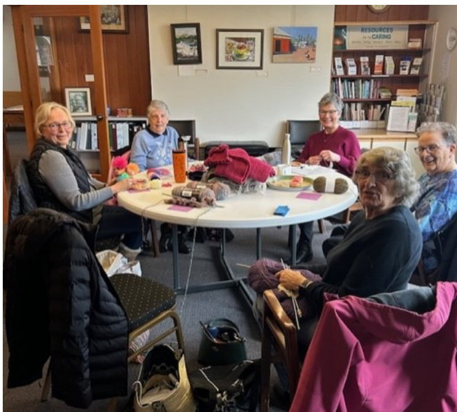
The Knitting Group

Trustees – the formal body that legally holds the property for the use and benefit of the congregation.