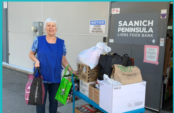
Food Bank receives Cordova Bay United's donations