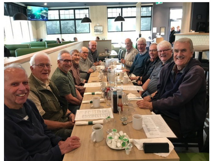
Men's Breakfast Group