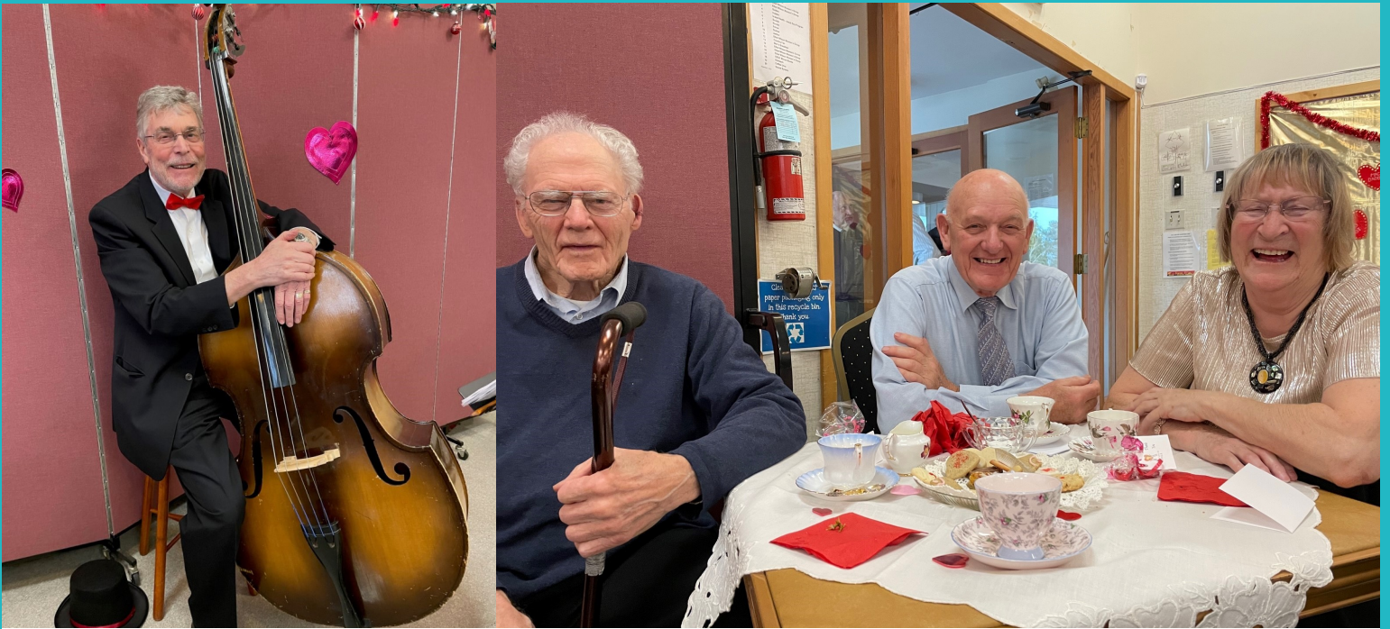
For the Love of Africa Valentine's Tea and Dance