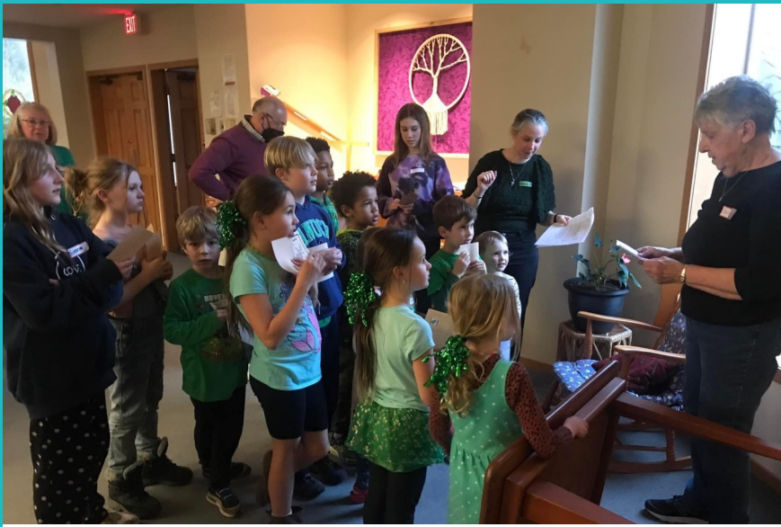
March Messy Church