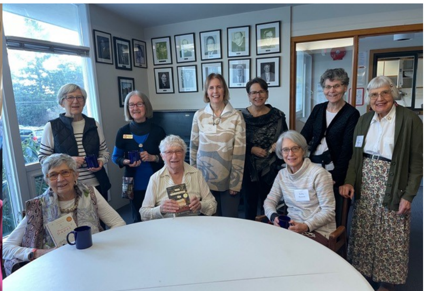
The Bookies Book Club