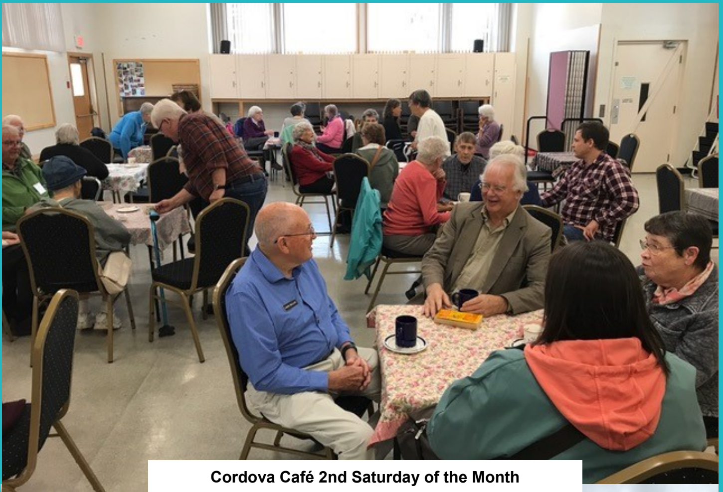
Cordova Café 2nd Saturday of the Month