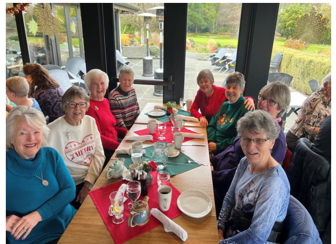
Ethel Wilson Women's Group Christmas Social