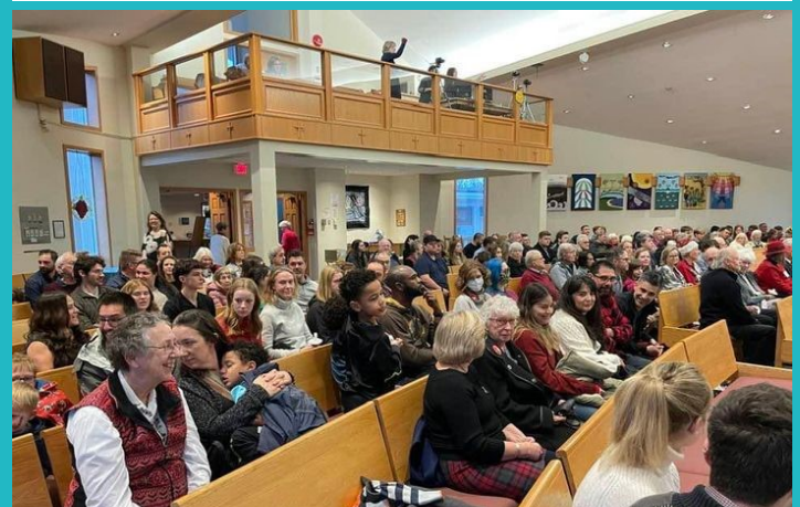
Christmas Eve Full House