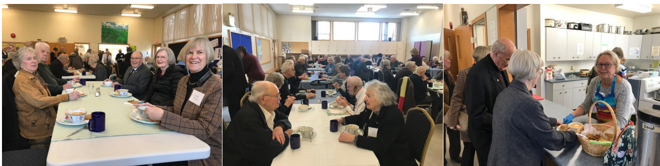
2023 Annual Meeting

Co-Chairs, Cordova Bay United Church Council