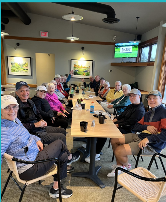
September Golf Social