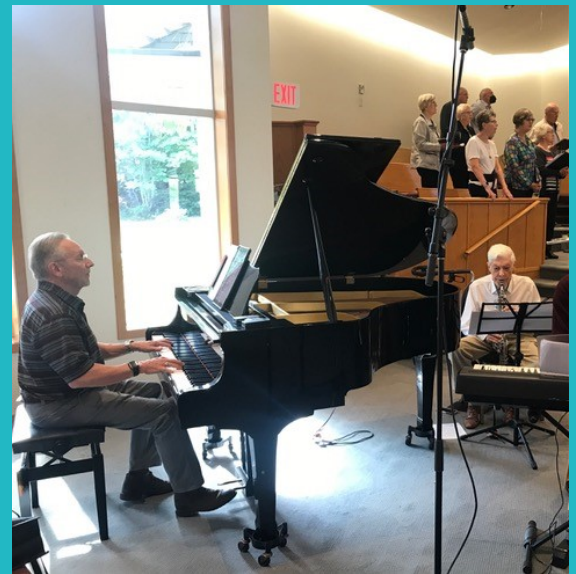
Homecoming Sunday, Sept 10