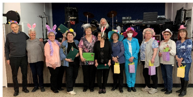
Easter Parade Contestants