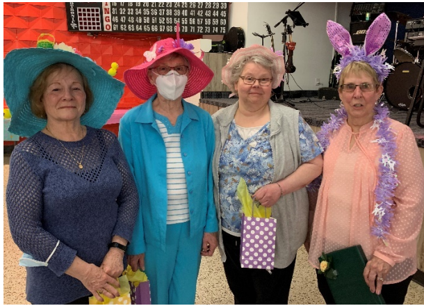
Easter Parade Winners