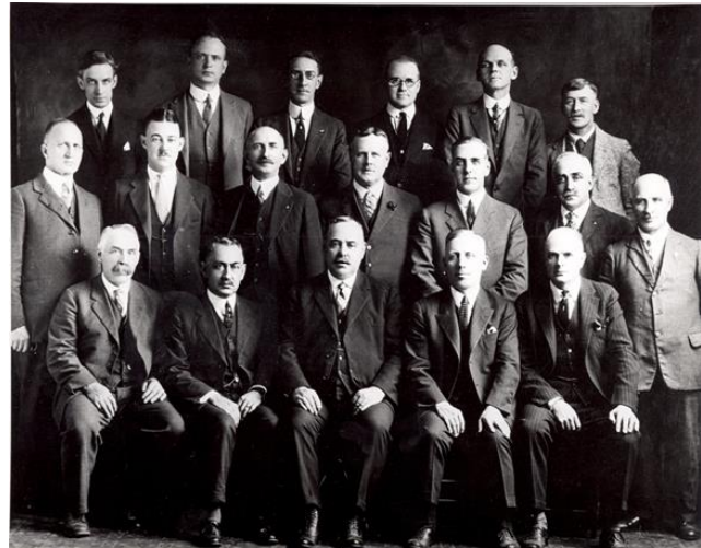
RMG Thomas Bouckley Collection, ID Number 2242