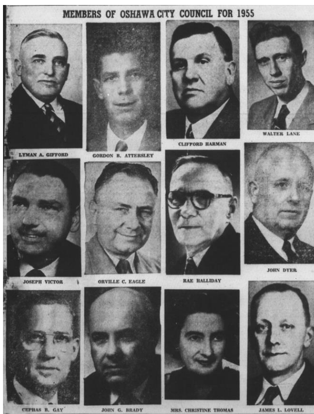
From: Daily Times-Gazette , 7 Dec 1954, p. 3