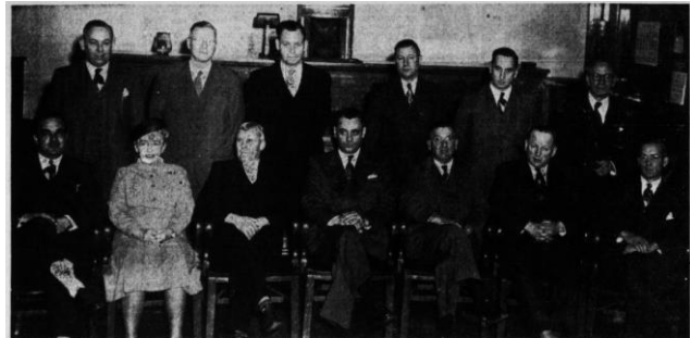
From: Daily Times-Gazette , 5 Jan 1952, p. 1