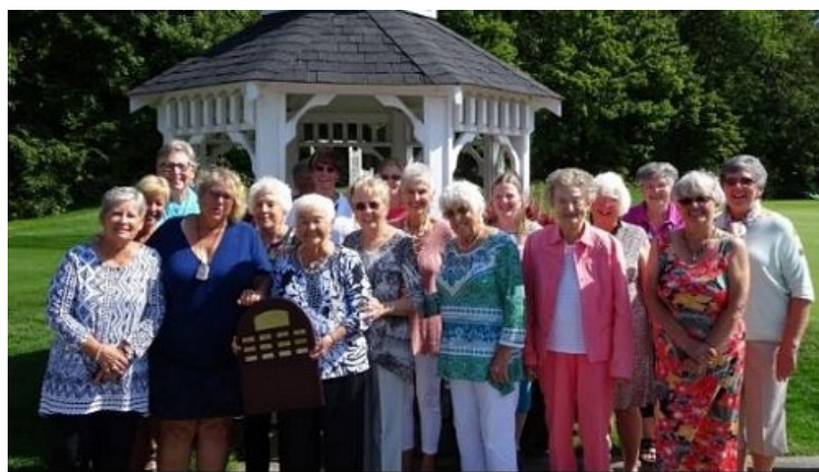
District 5 Leagues Ladies won and Burl. A Won, B were 3 rd

For the men, Burlington has two teams: "A" and "B". This year, Team "A" took the title with the "B" squad finishing third. The men's teams had their end-of-the-season lunch at Mandarin.