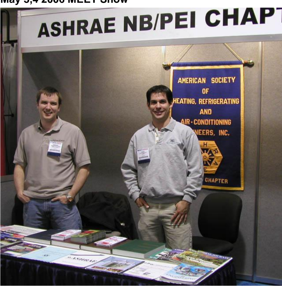
May 3,4 2006 MEET Show

NBCC Moncton hosted the Building for Sustainability Webcast and had a waiting audience of about 90 students and 10 instructors. Unfortunately, the actual transmission was unable to penetrate the campuses firewall and the show had to be cancelled after everyone arrived. The test available from connectlive.com did not test the same way the webcast was going to be transmitted.