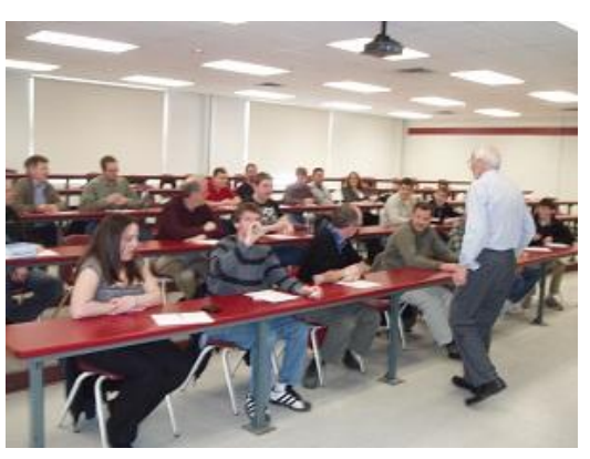
Problem Solving and Creativity Workshop at NBCC-Moncton Campus