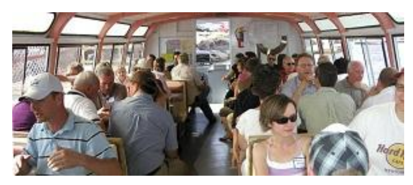
Mussels on the Bay