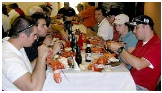
Surf and Turf