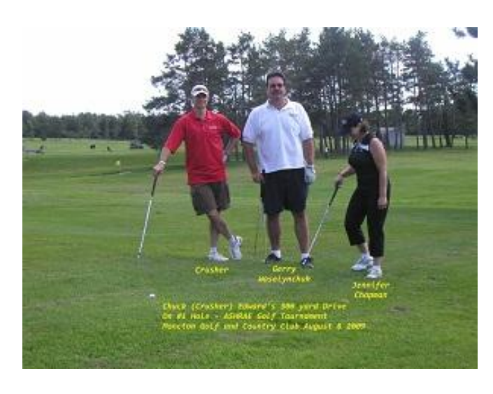
A trio of swingers