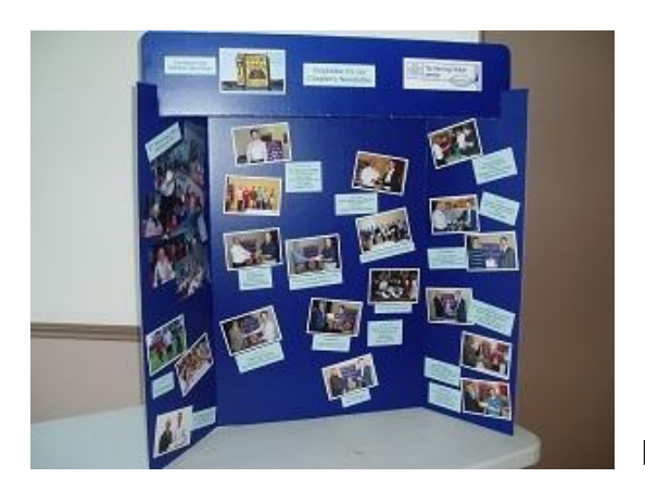
History Display – the year in review