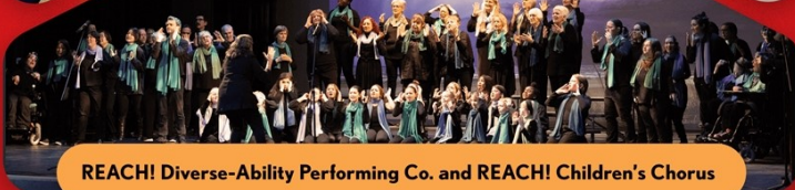
REACH! Diverse-Ability Performing Co. and REACH! Children's Chorus