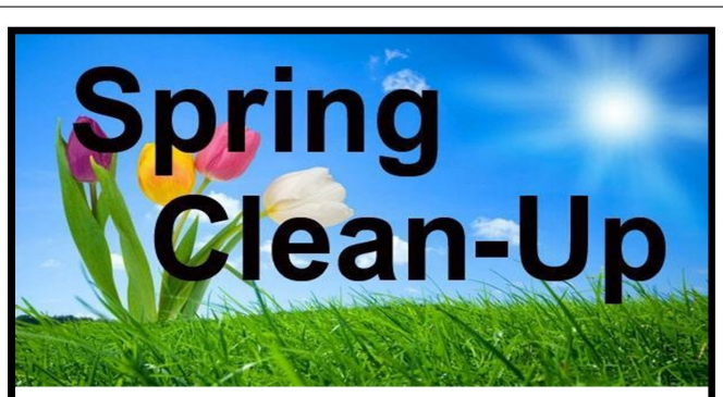
Lets all pitch in to clean up the place we call home!

Adults only evening—Tuesday, April 18 from 7-9pm here at the GC/FCSS Building. Everyone Welcome!