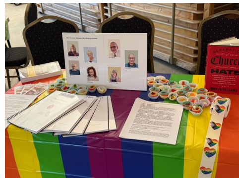
Affirming Committee Display Sunday February 18

If you missed the Affirming Committee presentation on Sunday, February 18, be sure to check out their display table in the Narthex. There you will find 'Frequently Asked Questions about Affirming Ministries' and 'A Short History of the United Church of Canada and Cordova Bay United Church's Affirming Journey.