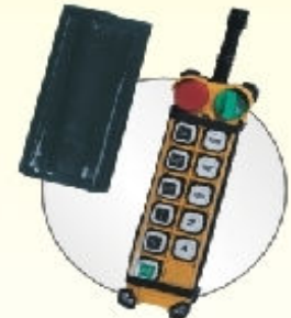
· Transmitter Protective cover