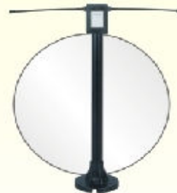
· Passive Antenna