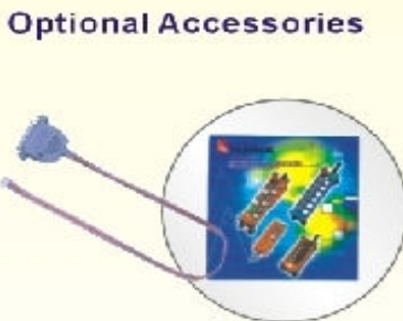
· CD Software & Program Cable