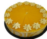
MANGO BUFFET item#432 Portions Cut 14 Price: $31.41 Size: 8" Shelf Life 3 Days Refrigeration Required