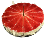
GLUTEN FREE RASPBERRY WHITE CHOCOLATE CHEESECAKE Item#508 Portions Cut 14 Price: $43.66 Size: 8" Shelf Life 3 Days Refrigeration Required