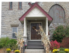
St. Thomas Anglican Church