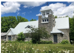
St. Mary's Anglican Church

Dear God, Thank you for all who have served and are serving. Bless the families whose loved ones made the Ultimate Sacrifice