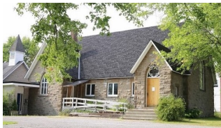
St. Paul's Anglican Church