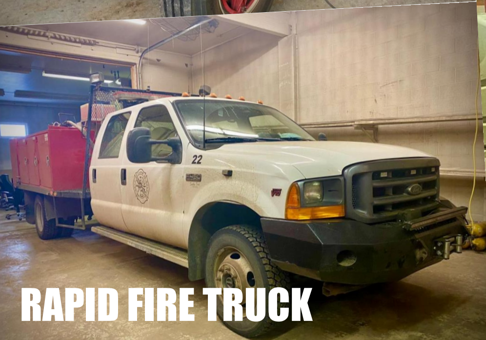
RAPID FIRE TRUCK