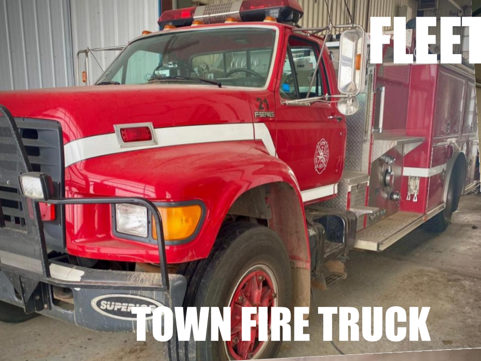
TOWN FIRE TRUCK