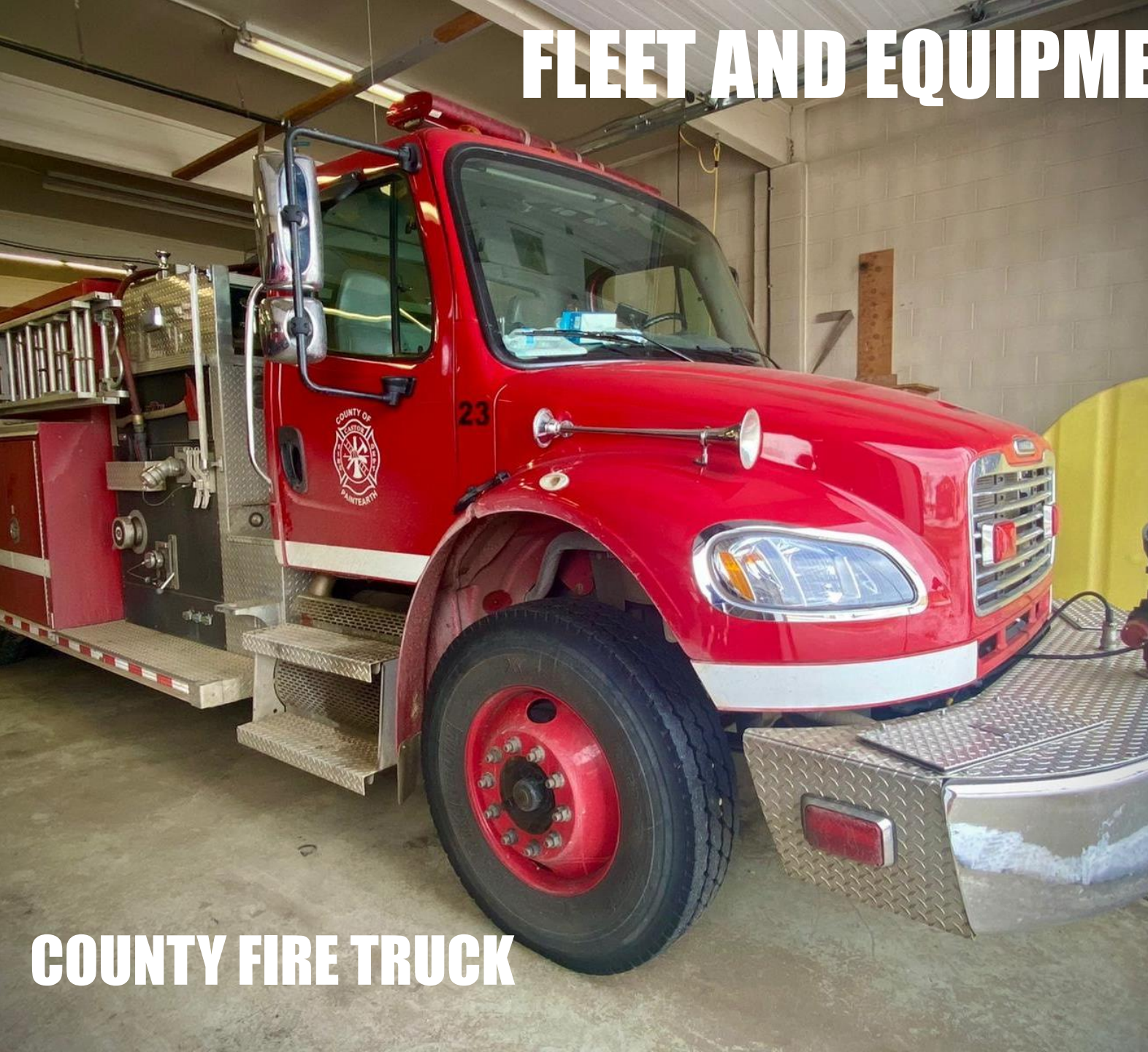
COUNTY FIRE TRUCK