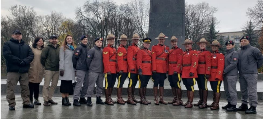
This picture shows the RCMP members on mission at Remembrance Day at the Tomb of the Unknown Soldier in Kyiv Ukraine.