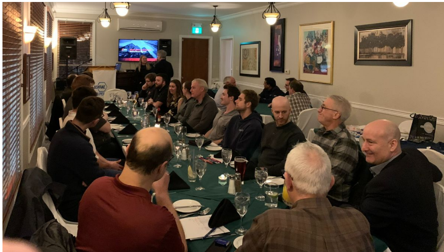
Strong New Year turn out!