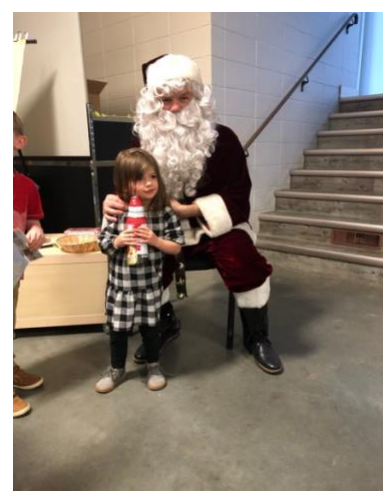
Santa and children at the December 4 th Pancake Breakfast