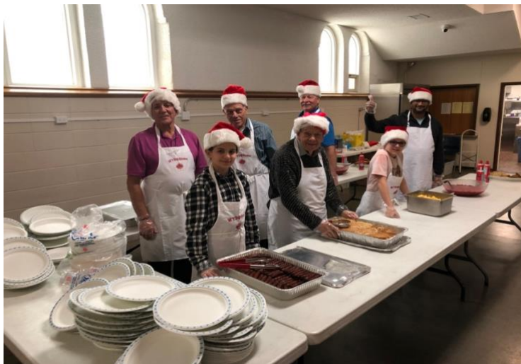
Santa helpful "Elves" at the December 4 th Pancake Breakfast