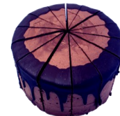
BELGIAN TRUFFLE item#485 Portions Cut 14 Size: 8" Shelf Life 3 Days Refrigeration Required