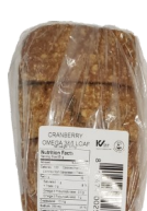
LABELLED CRANBERRY OMEGA SHORTS item#258 Portions Cut 7 *15 Loaves/Case Shelf Life 3 Days Refrigeration NOT Required