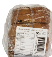
LABELLED BLUEBERRY LEMON SHORTS item#222 Portions Cut 7 *15 Loaves/Case Shelf Life 3 Days Refrigeration NOT Required