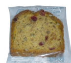
FLOW WRAPPED CRAN-OMEGA item#255d Sold By 24 slices/case Shelf Life 3 Days Refrigeration NOT Required