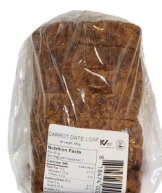
LABELLED CARROT DATE SHORTS item#225 Portions Cut 7 *15 Loaves/Case Shelf Life 3 Days Refrigeration NOT Required