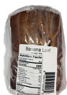
LABELLED BANANA SHORTS item#208 Portions Cut 7 *15 Loaves/Case Shelf Life 3 Days Refrigeration NOT Required