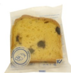
FLOW WRAPPED BB-LEMON item#218d Sold By 24 slices/case Shelf Life 3 Days Refrigeration NOT Required