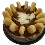
TIRAMISU BUFFET item#452 Portions Cut 14 Size: 8" Shelf Life 3 Days Refrigeration Required