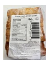
LABELLED LEMON PISTACHIO SHORT item#241 Portion Cut 7 *15 Loaves/Case Shelf Life 3 Days