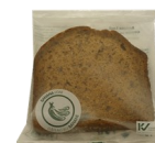
FLOW WRAPPED BANANA item#205d Sold By 24 slices/case Shelf Life 3 Days Refrigeration NOT Required