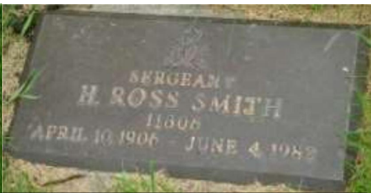
FLAT BRONZE MARKER 60.9 cm wide 30.48 cm high .635 cm thick Inscription Raised .32 cm