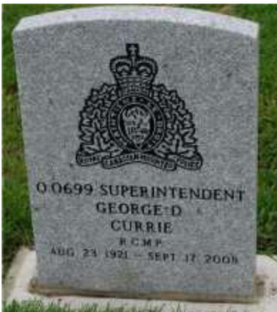
UPRIGHT GRANITE HEADSTONE 76.2 cm high 45.72 cm wide 7.62 cm thick

All bear the RCMP crest, member’s name, rank, regimental number, date of birth and date of death (see example photo’s below).