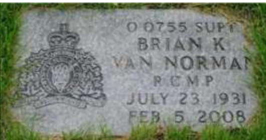
FLAT GRANITE MARKER 50.8 cm wide 30.48 cm high 7.62 cm thick