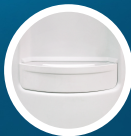
Removable Drip Tray