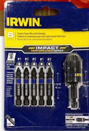
Impact Power Bits and Extension $9.95/ea