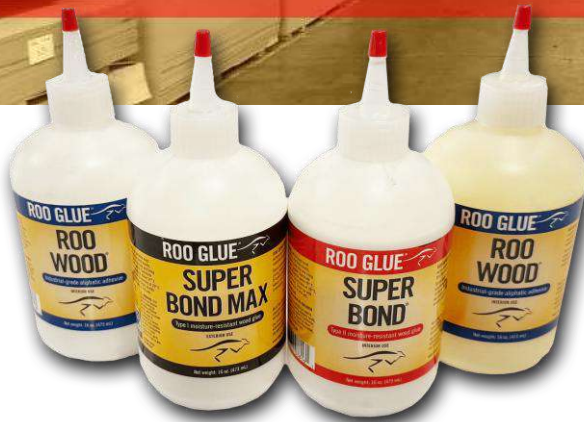
Roo Glue ($9.80 to $14.35)