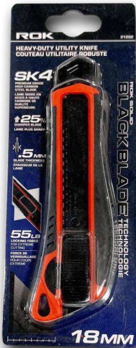
18mm Utility Knife Black Blade $1.95/ea