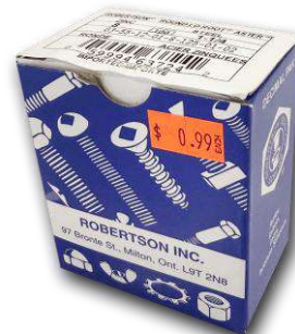
# 8 x 1-1/4" Pan head (100pcs/box) $0.99/ea