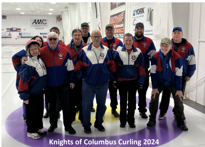
Knights of Columbus Curling 2024