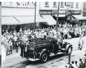
Fire truck in parade