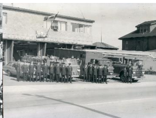
Personnel in front of fire station