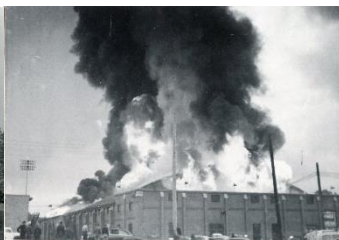
Oshawa Arena Fire