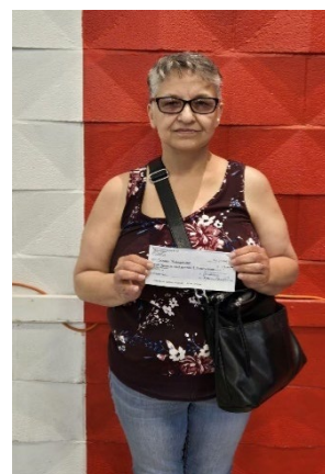
Lucky Star Winner