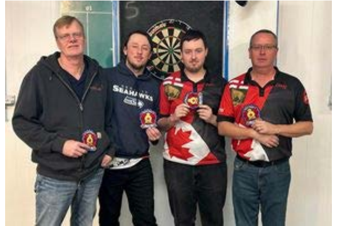
Darts in teams, 1 st place