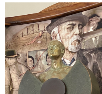
Calm Before Chaos, details

'The Mechanics of Meaning' is an exhibition of mixed media art including many assemblages, and to varying degrees all works represent a personal post-concussive study of a decades-long journey through life with an ABI (Acquired Brain Injury). Also known as 'The Invisible Injury', for an ABI survivor to try and explain their new sense of normal to people can be compared to trying to nail a hunk of Jello to an orange tree; largely fruitless. That considered, the intention with 'The Mechanics of Meaning' is to 'visually' showcase the issues, experiences, challenges and the mechanics of navigating through life with an ABI.