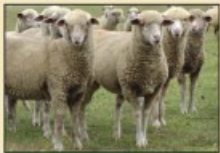
SOUTH AFRICAN MEAT MERINO