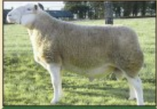
BERRICHON DU CHER