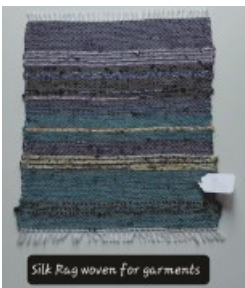
Silk Rag woven for garments