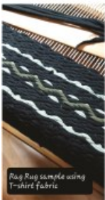
Rag Rug sample using T-shirt fabric