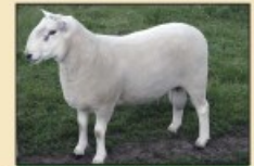
NORTH COUNTRY CHEVIOT