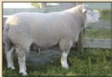
ILE DE FRANCE