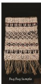
Rag Rug Sample