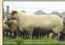
ROUGE DE L'OUEST