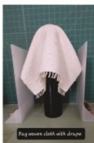
Rag woven cloth with drape