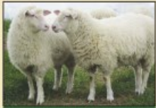
BRITISH MILK SHEEP