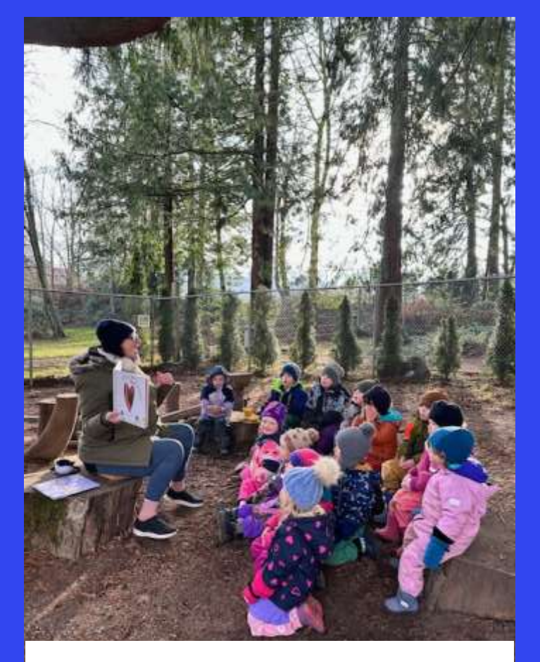
Carrot Seed Preschools outdoor learning