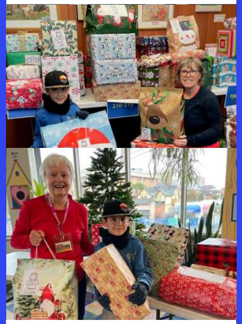
Another successful Angel Gift Program