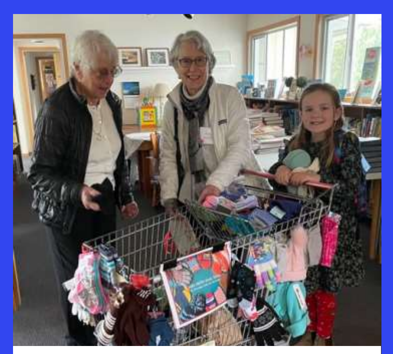
Donations for The Cridge Centre for the Family