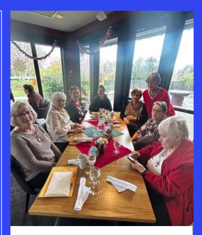
Ethel Wilson Women's Group Christmas Social