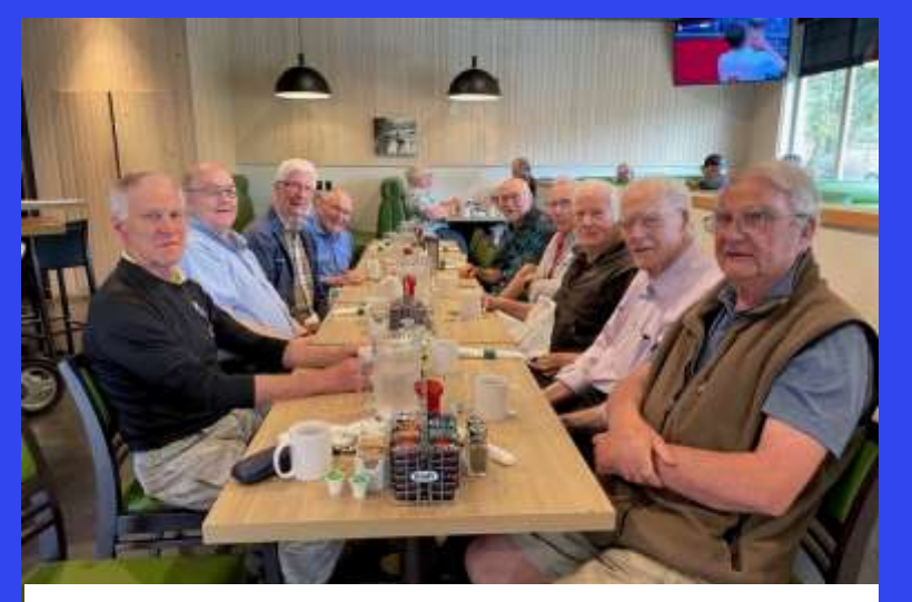
Men's Breakfast Group