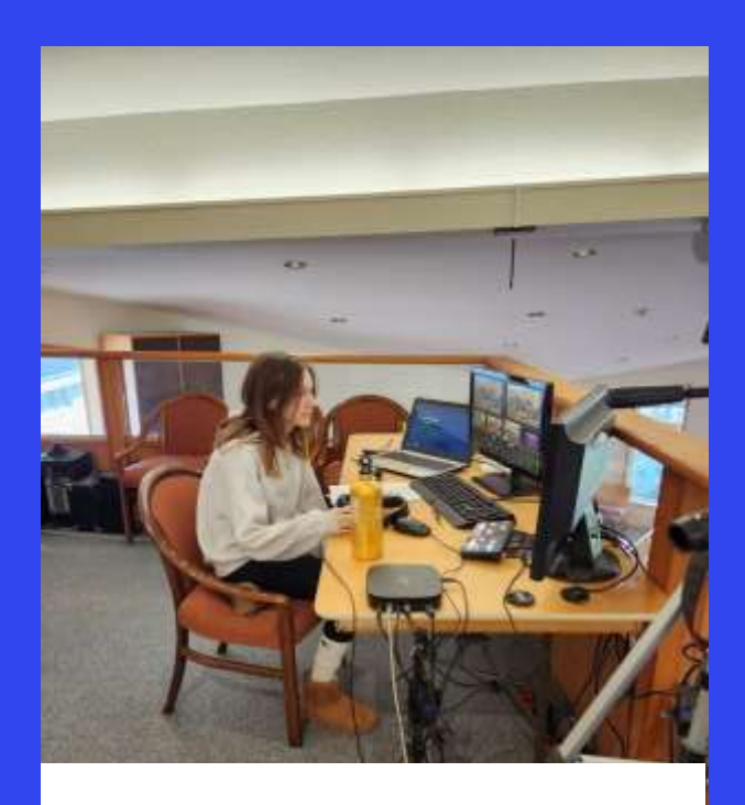
Livestream support from the best seat in the house