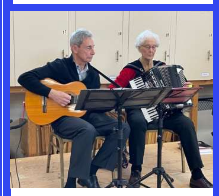
Cordova Café Entertainers