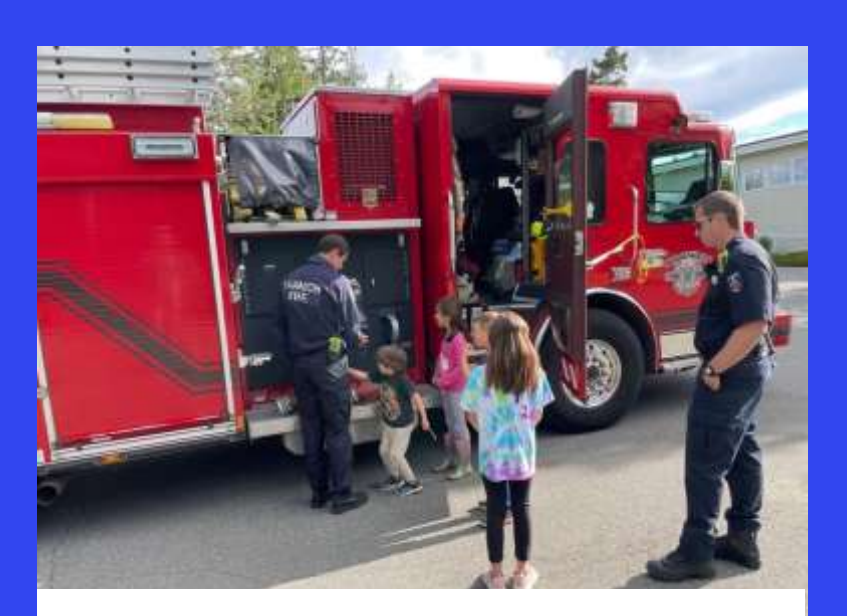
Summer Safety at Messy Church with the Saanich Fire Department