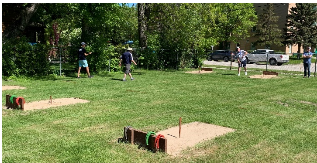
Contestants at horseshoes