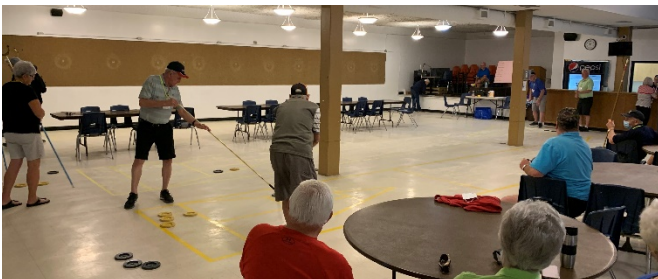
Contestants at floor shuffleboard