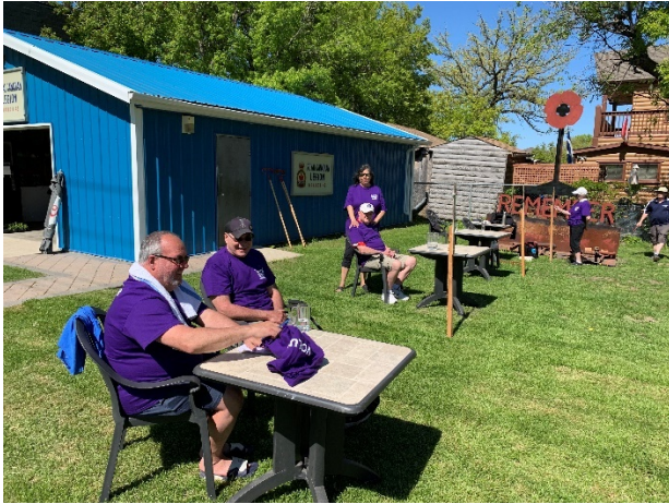
Volunteers at Over 55 Games

Thank you to our Legion Members who volunteered to assist the participants of the Games.