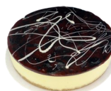
GLUTEN FREE LEMON BLUEBERRY CHEESECAKE item#502 Portions Cut 14 Size: 8" Shelf Life 3 Days Refrigeration Required