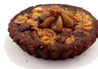
GF 4" VENUS HAZELNUT TARTLET item#781 Sold By 1/2 Doz Shelf Life 5 Days Refrigeration Optional