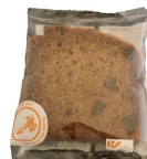
NEW! FLOW WRAPPED CARROT DATE item#200 Sold By 24 slices/case Shelf Life 3 Days Refrigeration NOT Required