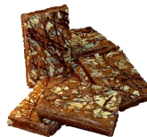
GF BELGIAN BROWNIE item#101 Sold By 1/2 Doz, Shelf life 3 Days