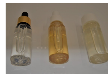
Enhanced Option – 1 oz PET Bottle with Gold and Black Dropper OR 1 oz PET Bottle with diffuser and straight smooth white cap *MOQ: 2,500pc