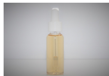
Standard Option - 1oz PET Bottle with White Dropper. *MOQ: 250pc