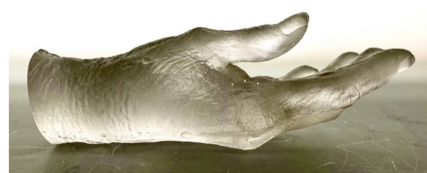
Celebrating the power we hold in our hands through the beauty of glass.

A registered exhibit of The International Year of Glass 2022