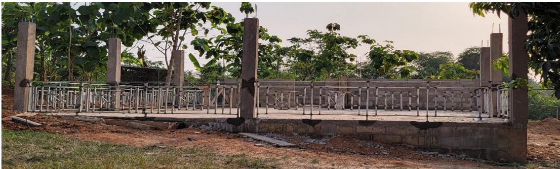
Finish this Shelter on Playground Project for Outdoor learning use