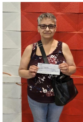
Lucky Star Winner