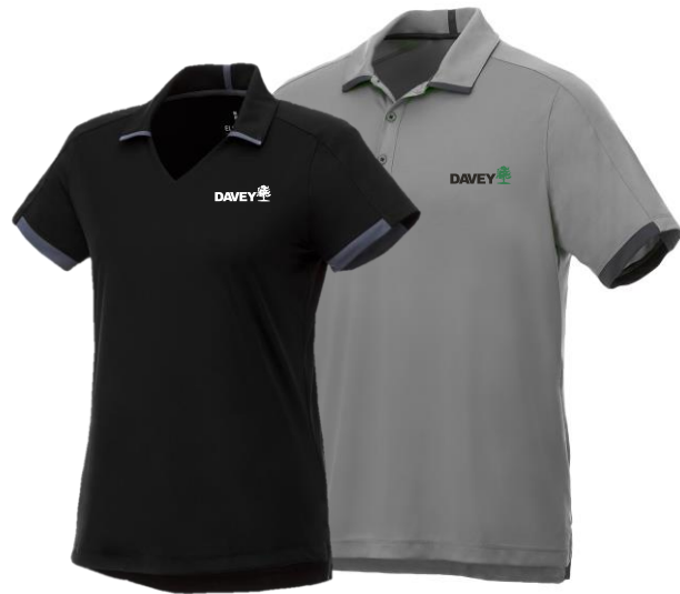
Shirt Colours: Apple/Grey Storm, Black/Grey Storm & Quarry/Grey Storm With a DTF Transfer on Left Chest

100% Polyester textured knit with wicking finish. 155 g/m 2 (4.6 oz/yd 2 ).