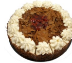
BLACK FOREST item#401 Portions Cut 14 Price: $29.66 Size: 8" Shelf Life 3 days Refrigeration Required