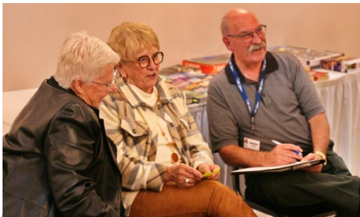
THE THREE JUDGES

We had a smaller crowd than usual attend our last General/Dinner Meeting, but some of those who attended didn't disappoint when it came to dressing up in your best Halloween costume. There were prizes given to some those dressed up people, as judged by three experts and they are as follows: