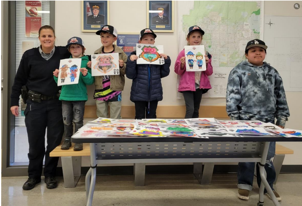
Wabasca School Visit