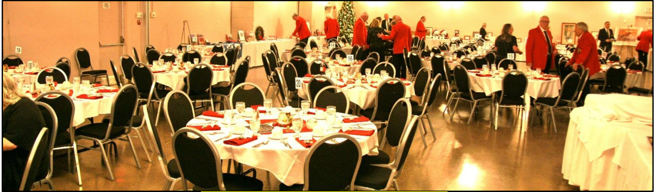
Prior to most people arriving

Now a few more pictures from this evening.