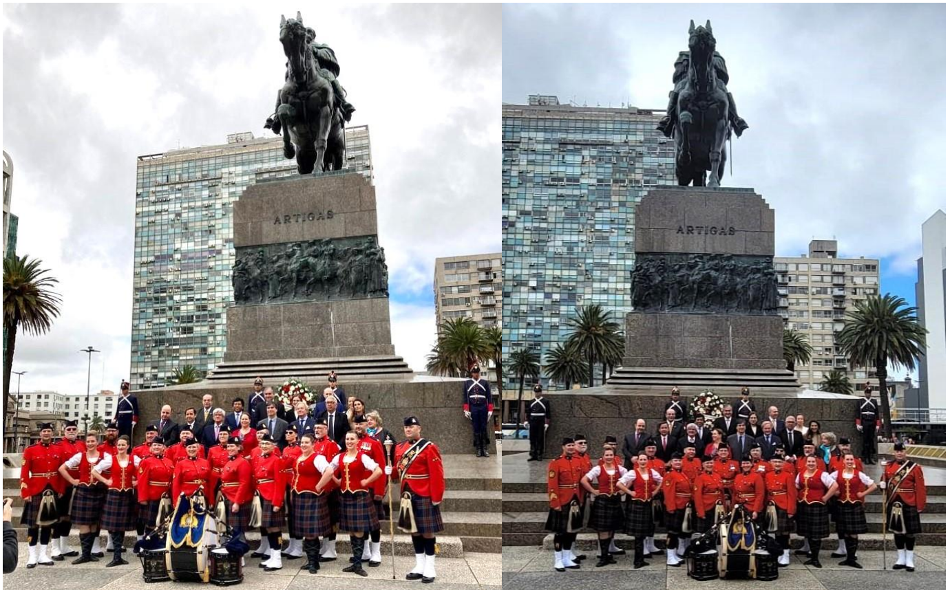
These images are of the full band posing with the President of Uruguay and the Canadian Ambassador in front of the Jose Artigas Montevideo City Statue. Artigas was the founder of Uruguay and the RCMP Alberta Regimental Pipes, Drums and Dancers Band performed to honor the memory of Artigas for the assembled dignitaries.