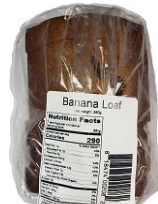
LABELLED BANANA SHORTS item#208 Portions Cut 7 *15 Loaves/Case Shelf Life 3 Days Refrigeration NOT Required