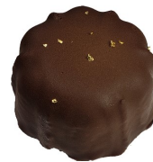
INDIVIDUAL LAVA CAKE item#622 Sold By 1/2 Doz Shelf Life 3 Days Refrigeration Required