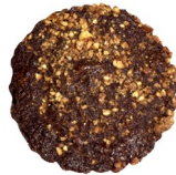
GF PECAN TORTE item#640 Sold By 1/2 Doz Shelf Life 5 Days Refrigeration Recommended