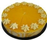
MANGO BUFFET item#432 Portions Cut 14 Size: 8" Shelf Life 3 Days Refrigeration Required