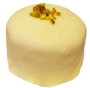
INDIVIDUAL CARROT CAKE item#602 Sold By 1/2 Doz Shelf Life 4 Days Refrigeration Required