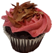
NEW! GF VEGAN CHOCOLATE RASPBERRY CUPCAKE item#276 Sold By 1/2 Doz Shelf Life 5 Days Refrigeration Optional