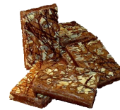
GF BELGIAN BROWNIE item#101 Sold By 1/2 Doz, Shelf life 3 Days