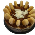
TIRAMISU BUFFET item#452 Portions Cut 14 Size: 8" Shelf Life 3 Days Refrigeration Required