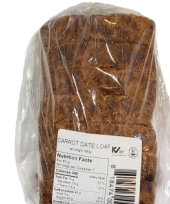
LABELLED CARROT DATE SHORTS item#225 Portions Cut 7 *15 Loaves/Case Shelf Life 3 Days Refrigeration NOT Required