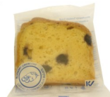
FLOW WRAPPED BB-LEMON item#218d Sold By 24 slices/case Shelf Life 3 Days Refrigeration NOT Required