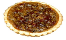
4" FRENCH BUTTER TARTLET item#767 Sold By 1/2 doz Shelf Life 3 Days Refrigeration Optional