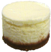
GF NY CHEESECAKE item#628 Sold By 1/2 Doz Shelf Life 5 Days Refrigeration Required