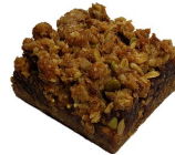
DATE item#106 Sold By 1/2 Doz Shelf Life 4 Days Refrigeration Optional