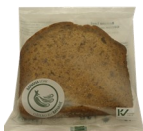
FLOW WRAPPED BANANA item#205d Sold By 24 slices/case Shelf Life 3 Days Refrigeration NOT Required