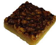
PECAN item#118 Sold By 1/2 Doz Shelf Life 4 Days Refrigeration Optional