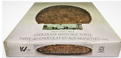
NEW! GF 9" Chocolate Hazelnut Torte Sold By 1 torte, UNCUT, item# 703 Sold By 1/2 doz, item#703c Shelf Life 14 Days Refrigeration Recommended