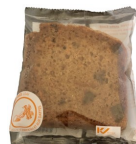
NEW! FLOW WRAPPED CARROT DATE item#200 Sold By 24 slices/case Shelf Life 3 Days Refrigeration NOT Required