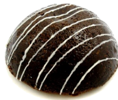
GF CARAMEL BOMBE item#607 Sold By 1/2 Doz Shelf Life 5 Days Refrigeration Required