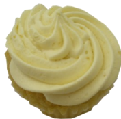
GF VEGAN LEMON CUPCAKE item#774 Sold By 1/2 Doz Shelf Life 5 Days Refrigeration Optional