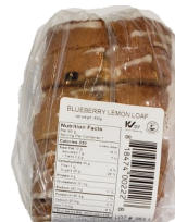
LABELLED BLUEBERRY LEMON SHORTS item#222 Portions Cut 7 *15 Loaves/Case Shelf Life 3 Days Refrigeration NOT Required