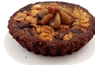
GF 4" VENUS HAZELNUT TARTLET item#781 Sold By 1/2 Doz Shelf Life 5 Days Refrigeration Optional