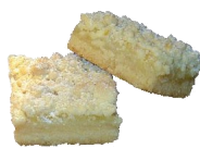
OLD FASHIONED LEMON item#115 Sold By 1/2 Doz Shelf Life 4 Days Refrigeration Required