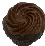
GF VEGAN CHOCOLATE CUPCAKE item#772 Sold By 1/2 Doz Shelf Life 5 Days Refrigeration Optional