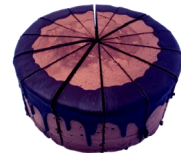
BELGIAN TRUFFLE item#485 Portions Cut 14 Size: 8" Shelf Life 3 Days Refrigeration Required