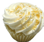
GF VEGAN COCONUT CUPCAKE item#775 Sold By 1/2 Doz Shelf Life 5 Days Refrigeration Optional