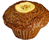
NEW! BANANA PINEAPPLE BRAN MUFFIN Item#198 Shelf life 3 days Refrigeration NOT required