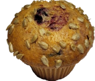
NEW! RASPBERRY BLUEBERRY SUNFLOWER MUFFIN Item#199 Shelf life 3 days Refrigeration NOT required