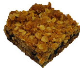
BLUEBERRY OAT item#132 Sold By 1/2 Doz Shelf Life 3 Days Refrigeration Required