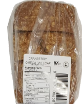
LABELLED CRANBERRY OMEGA SHORTS item#258 Portions Cut 7 *15 Loaves/Case Shelf Life 3 Days Refrigeration NOT Required