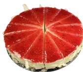
NEW! GLUTEN FREE RASPBERRY WHITE CHOCOLATE CHEESECAKE Item#508 Portions Cut 14 Size: 8" Shelf Life 3 Days Refrigeration Required