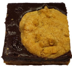
BELGIAN FUDGE OAT item#127 Sold By 1/2 Doz Shelf Life 4 Days Refrigeration Optional