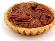
GF 4" PECAN TARTLET item#779 Sold By 1/2 Doz Shelf Life 5 Days Refrigeration Optional