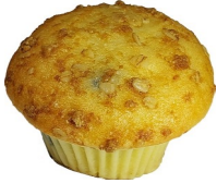
NEW! BLUEBERRY LEMON MUFFIN item#196 Shelf life 3 days Refrigeration NOT required

Individually wrapped in clear film, No nutritional's on package. Please request specification sheet. SINGLE FLAVOUR available, Sold by: 20 pcs