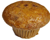
NEW! CARROT RAISIN MUFFIN item#197 Shelf life 3 days Refrigeration NOT required