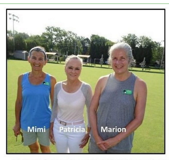
Congratulations to our District 5 teams playing in the Provincial Novice Triples

Note: the 2nd place team also played in the Provincial Novice Championships in Sarnia as Team "5B".